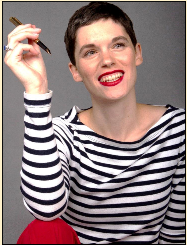
Kim Sherwood.

A Wild & True Relation is a smuggling adventure set in Devon with the South Hams at its heart. Come along on March 2 nd to hear more about smuggling history: from the Kingsbridge Estuary to Totnes and beyond to Dartmoor.